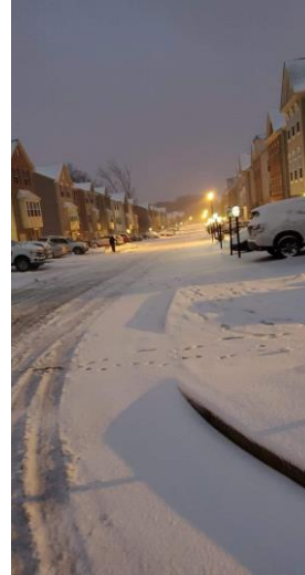
Submitted by Nessa Rose.