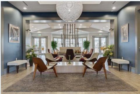
Pictured above is the main clubhouse entrance photographed as part of a recent HouseLens project for amenity images for homeowner use. See Page 2 for a link to the posted image gallery and Matterport 3D.

Would you like to have your photography featured in our Tanyard Times newsletter? Submit your Maryland, Glen Burnie and Tanyard Springs Community photos to tanyardsprings@abarisrealty.com with your name and a short description of your photo for a chance to be featured in the next edition of the Tanyard Times.