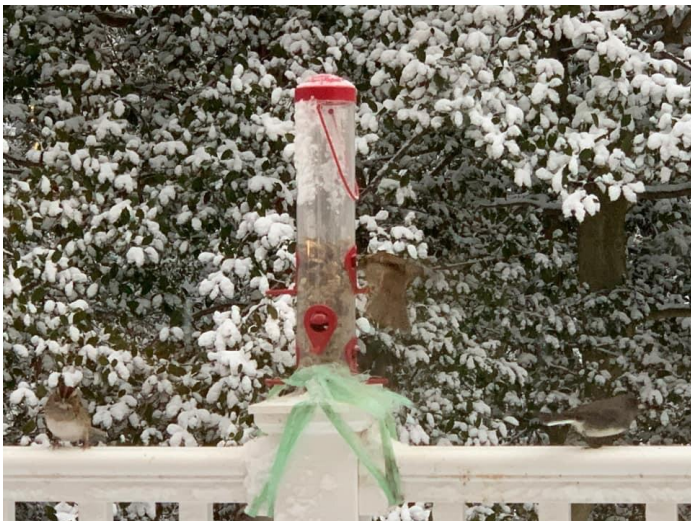
Submitted by Freida Racelis Guino.

Enjoy some snaps of our beautiful community on this snow day! Stay safe neighbors!