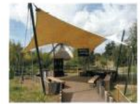
Tensile Shade Structure