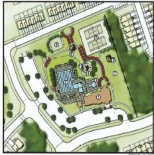
CLUBHOUSE ENLARGEMENT SCALE 1"=30'

█ = AREA TO PUT SNOW IN MAJOR EVENTS █ = 4 FT SIDEWALK █ = SIDEWALK BEHIND PARKING █ = 6 FT SIDEWALK █ = COUNTY SIDEWALKS █ = HANDICAP RAMP Black = Lennar (do not plow)