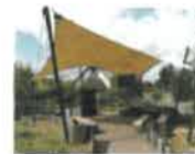
Tennis Shade Structure