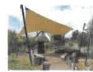
Tanala Shade Structure